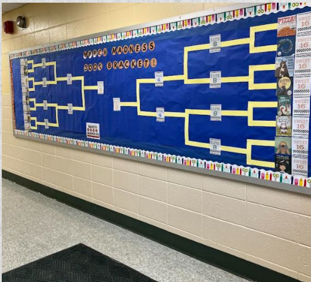
Bulletin Board in March highlighting 16 book bracket challenge.

Every March schools across the country celebrate the joy of reading and the benefits that come with it.