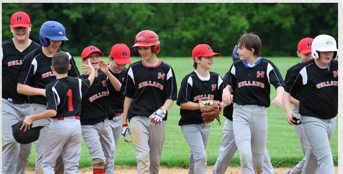
HTS Baseball Team walks off field during game vs Alexandra.

On May 17th, the Warriors season came to an end when they were defeated by Alexandria Township in the first round of the playoffs. The Warriors will try to improve their playoff success next season.