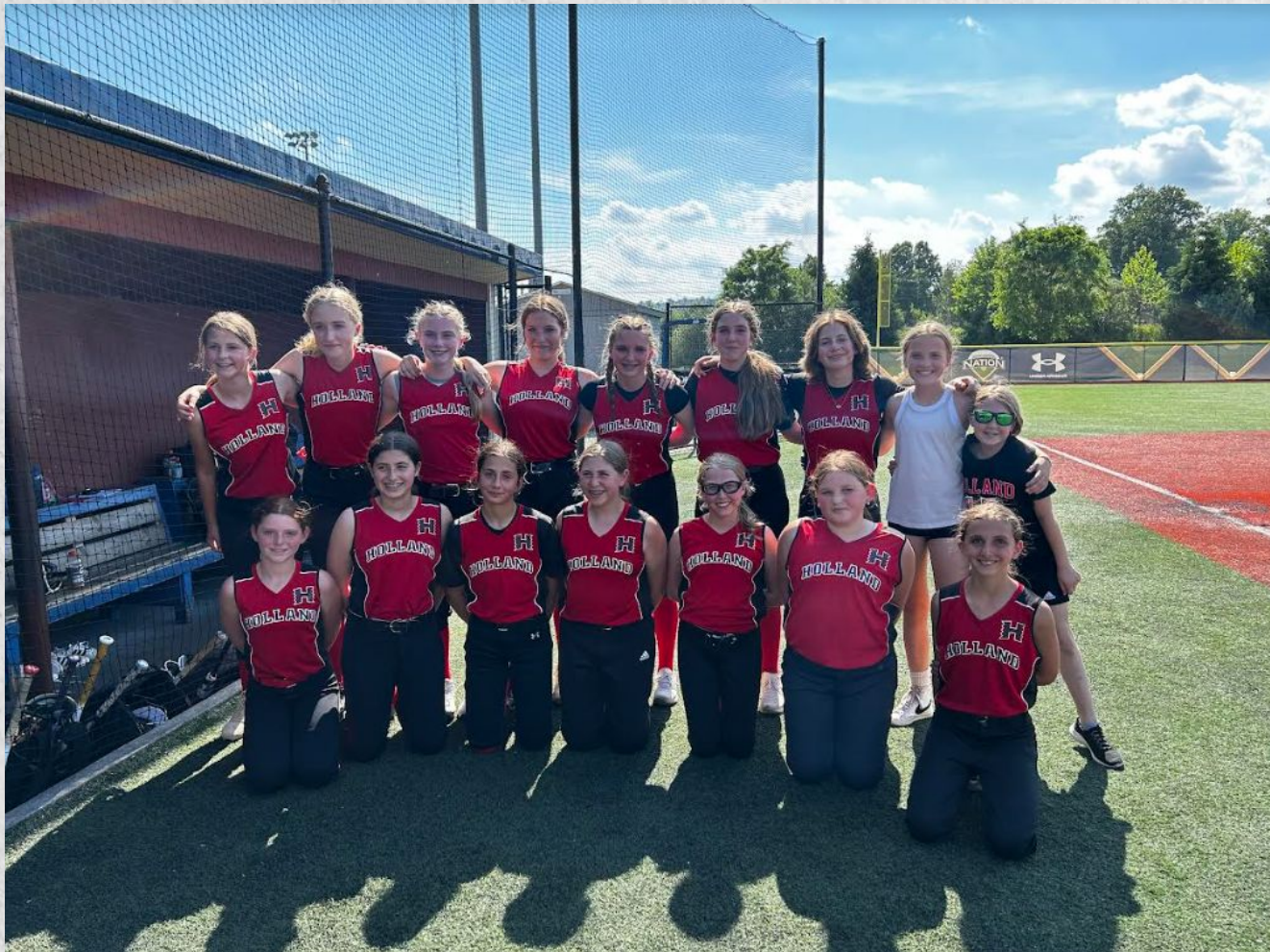
Softball team takes picture at Diamond Nation in Flemington, NJ.