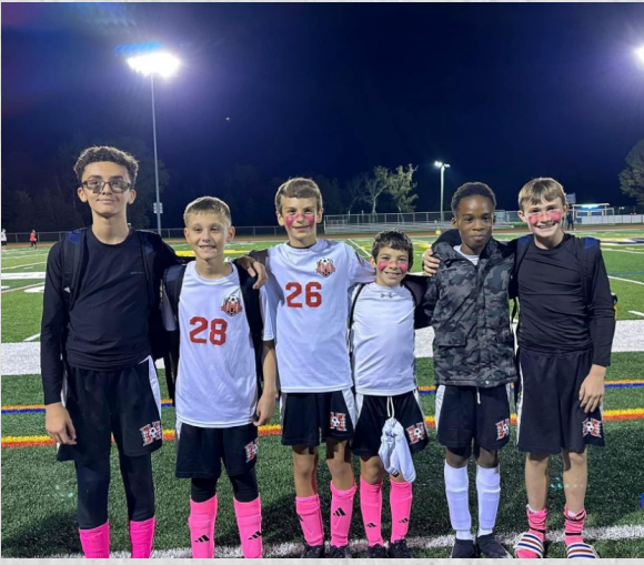
Members of the Holland Soccer team pose for a picture after their game vs Alexandria on October 18th at Del Val High School.