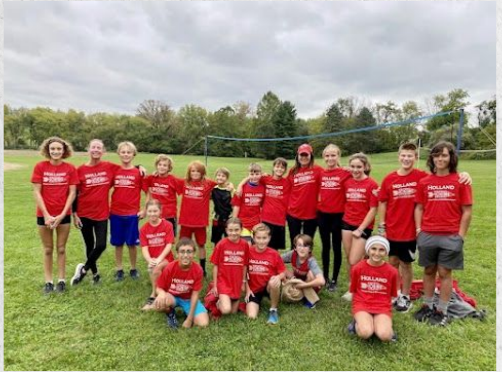
The 2023 Holland Cross Country team take group photo during the season.

It didn't matter if it was the girls' team or the co-ed team on the field. Both teams battled hard and represented Holland in a winning fashion.