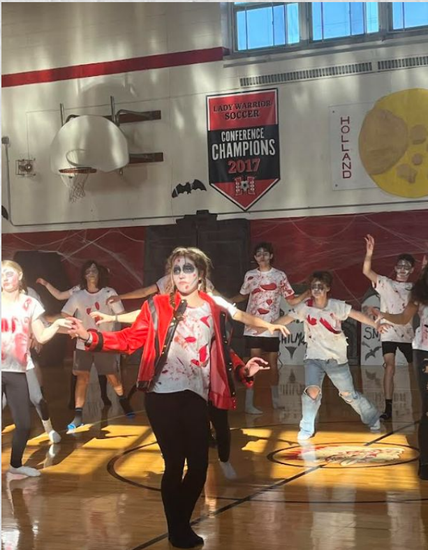
8th grade students perform the 1980's hit song Thriller on Halloween.